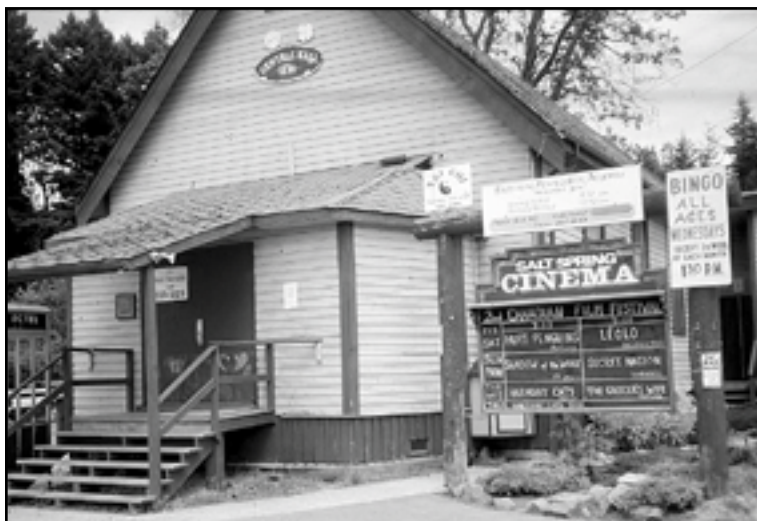
Salt Spring Cinema in the early 90's at Central Hall.